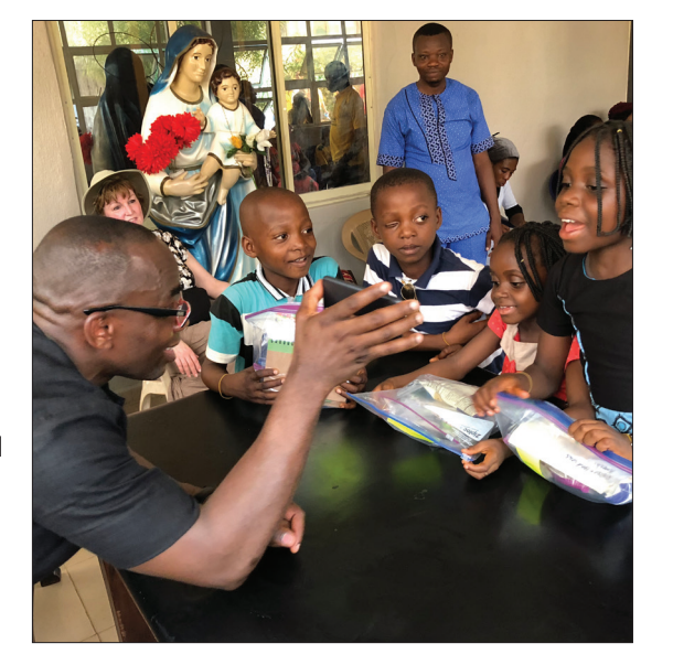
Some Pray. Some Give. Some Go. Some Do.